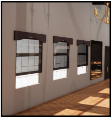
ROLLER SHADES WITH VALANCES

NOTE - Color choices palettes we determine